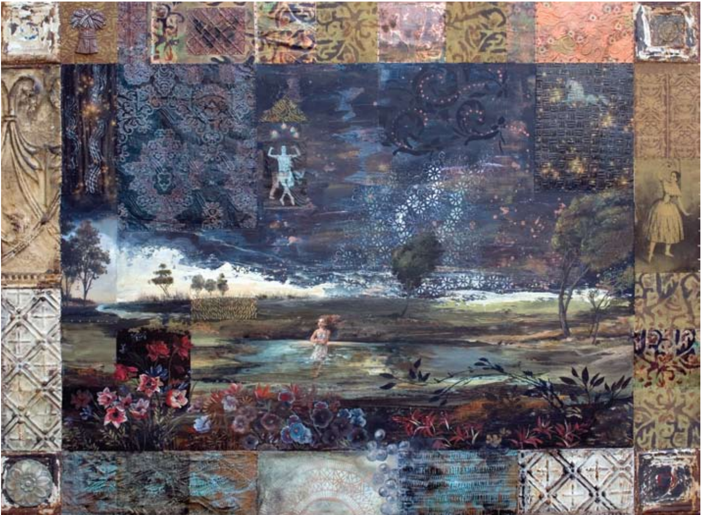
DARK SILK EMBROIDERIES OF SKY, ACRYLIC, OIL, HAND EMBOSSED PATINATED AND PRINTED COPPER, PRINTED BRONZE WIRE CLOTH, ANTIQUE TIN AND PLASTER APPLIQUÉ ON WOOD PANEL, 43 X 58"