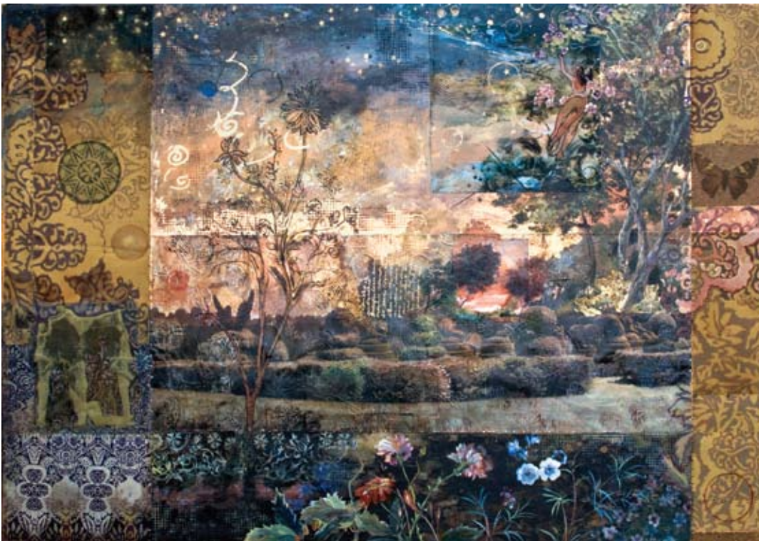
DANCE—RED APRICOT OF SUN, MIXED MEDIA, 31 X 43"