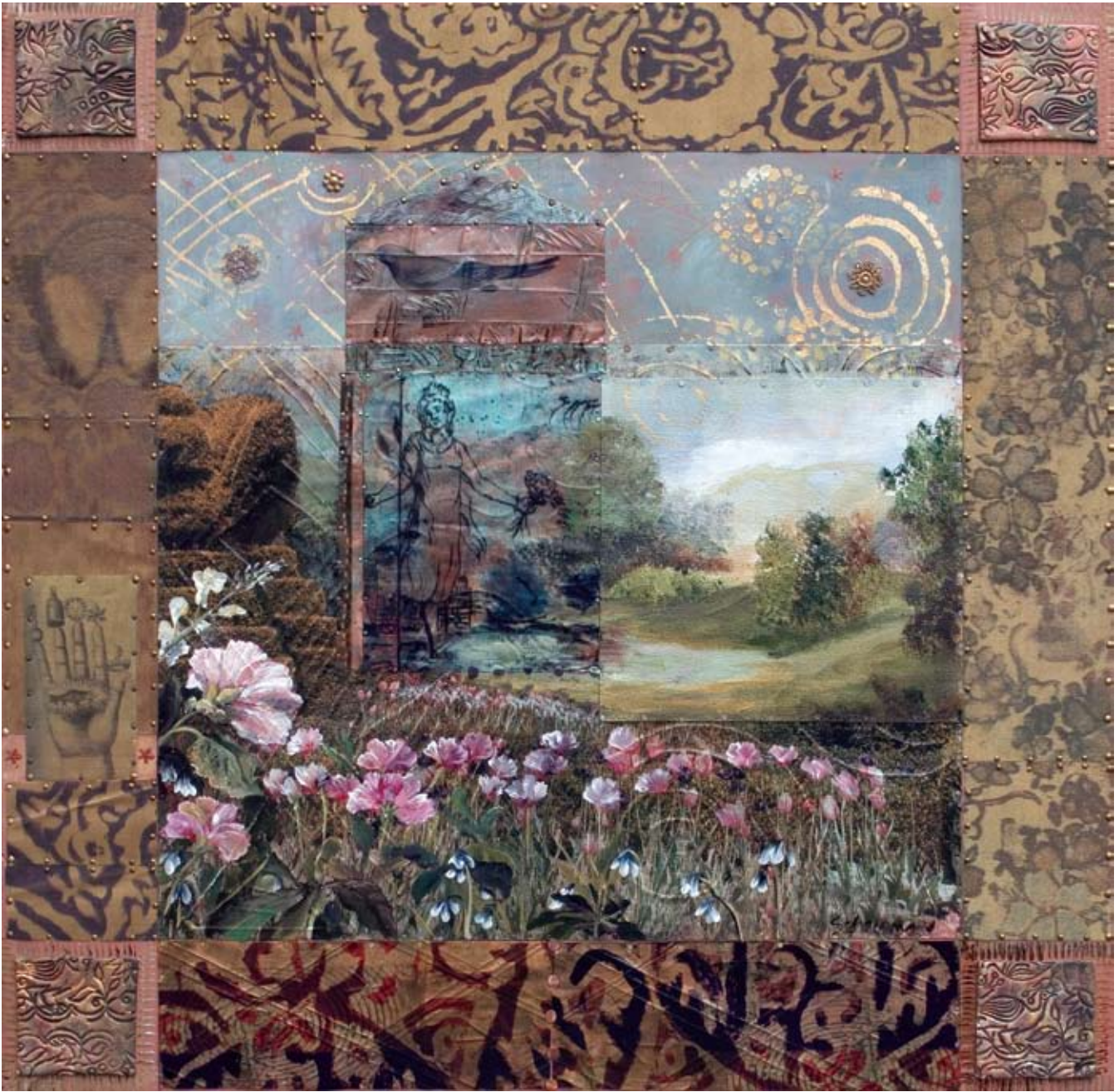
GOLDEN ENVY OF WILD BIRDS, MIXED MEDIA, 21 X 21"