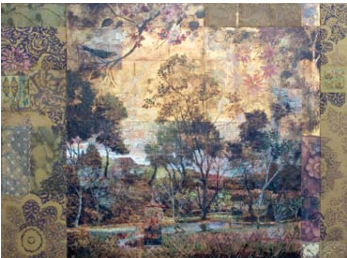
IN SPRING (DAWN'S TAPESTRY OF GOLD), MIXED MEDIA, 43 X 58"