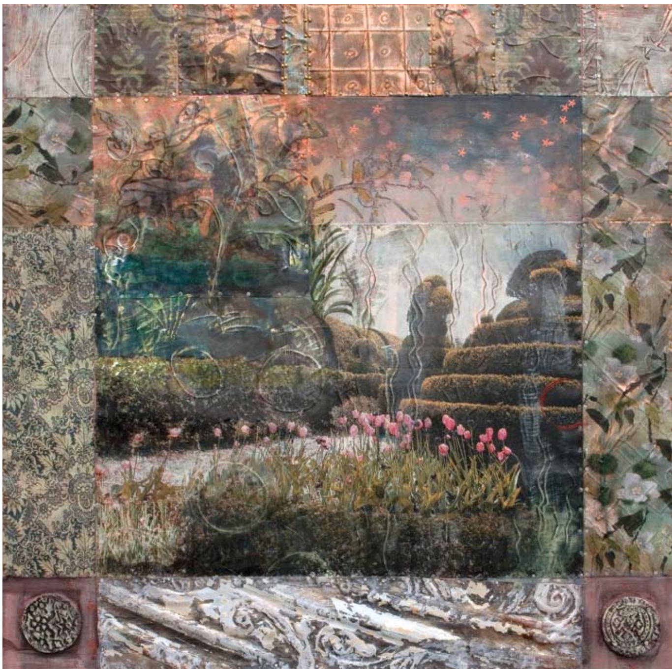
SERENADE—ON STREAMERS OF DUSK, MIXED MEDIA, 21 X 21"

These narratives are based on many different influences, including Scheinman's love of travel, her interest in botany and botanical gardens and her desire to capture the beauty of the light of a moment or the magic of a remembered landscape.